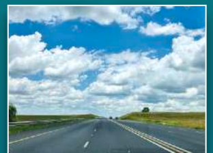
從德班一路向西北 Drive to Pretoria