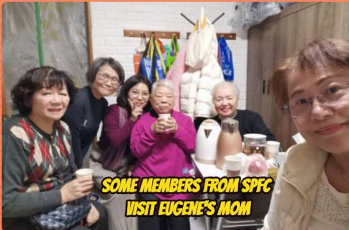
SOME MEMBERS FROM SPFC VISIT EUGENE'S MOM