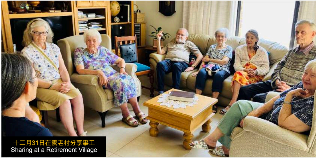
十二月31日在養老村分享事工 Sharing at a Retirement Village