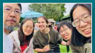
自拍全家福 Family selfie