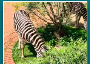
自然公園 - 斑馬 Nature Reserve - Zebras