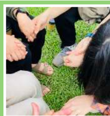
離別前一起禱告 Family payer before departure