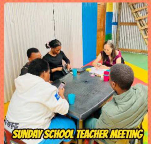
SUNDAY SCHOOL TEACHER MEETING