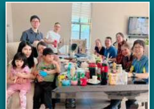
探望兩弟兄家庭 Lunch with 2 families